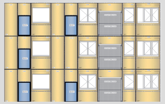
High flexibility in adjusting the units to the facade layout

The design of the project is under realisation and the BIM of the renovated building will be created in the coming months.