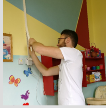
Installation Comfort Eye system

The Comfort Eye, the P2ENDURE innovative sensing solution for the Indoor Environmental Quality (IEQ) monitoring, has been installed in the summer of 2018 in the two