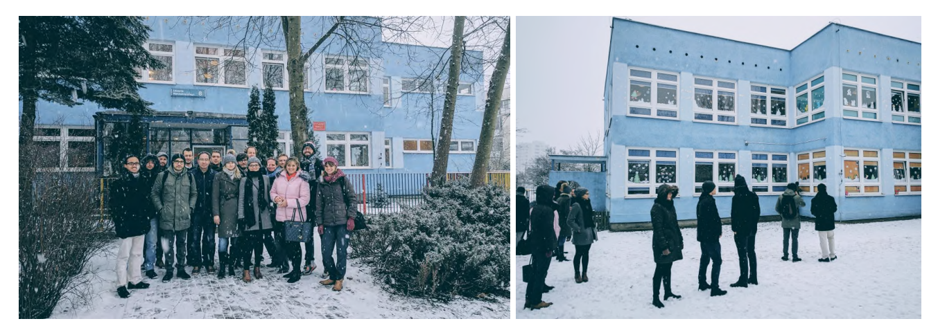
Visiting the Nursery building in Warsaw during the Technical Workshop

Following the Kick-off meeting in Delft, a technical workshop was organised in Warsaw (PL) on the 31<sup>st</sup> of January – 2<sup>nd</sup> of February 2017. The goal of this workshop was to reach preliminary agreements on the implementation of P2ENDURE solutions and tools in the real demonstration projects that are most likely to start in the near future, and to obtain detailed insight (technical, financial and time-wise) into the offered solutions. To this aim, all consortium members and few stakeholders were present. On the 2<sup>nd</sup> of January a site visit to the demonstration building (nursery) was organised by the Municipality of Warsaw ( see picture below ).